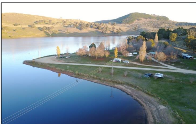
Carcoar Dam Camping Area

Carcoar Dam – 99.5%, with nil inflow or release.